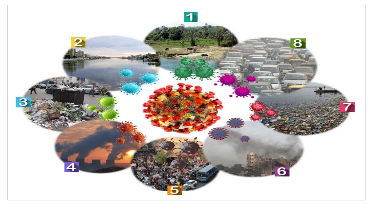
Fig. 1.General features of different environmental pollution problems affecting soil, water, plants and air and their pathways under the umbrella of COVID-19 as presented in an agroecosystem (photo 1), surface water (photo 2), agro-wastes and other wastes (photo 3), power plants (photo 4), crowded societies that are very sensitive to COVID-19 (photo 5), air pollution changes (photo 6), intensive water pollution (photo 7) and air pollution from vehicle emissions (photo 8)

Therefore, this review is an attempt to highlight COVID-19 and its relationship with the pollution of soil and air through the following topics: what are the links between air pollution and COVID-19? How might the COVID-19 outbreak affect soil pollution status? What are the expected broader environmental impacts of COVID-19?