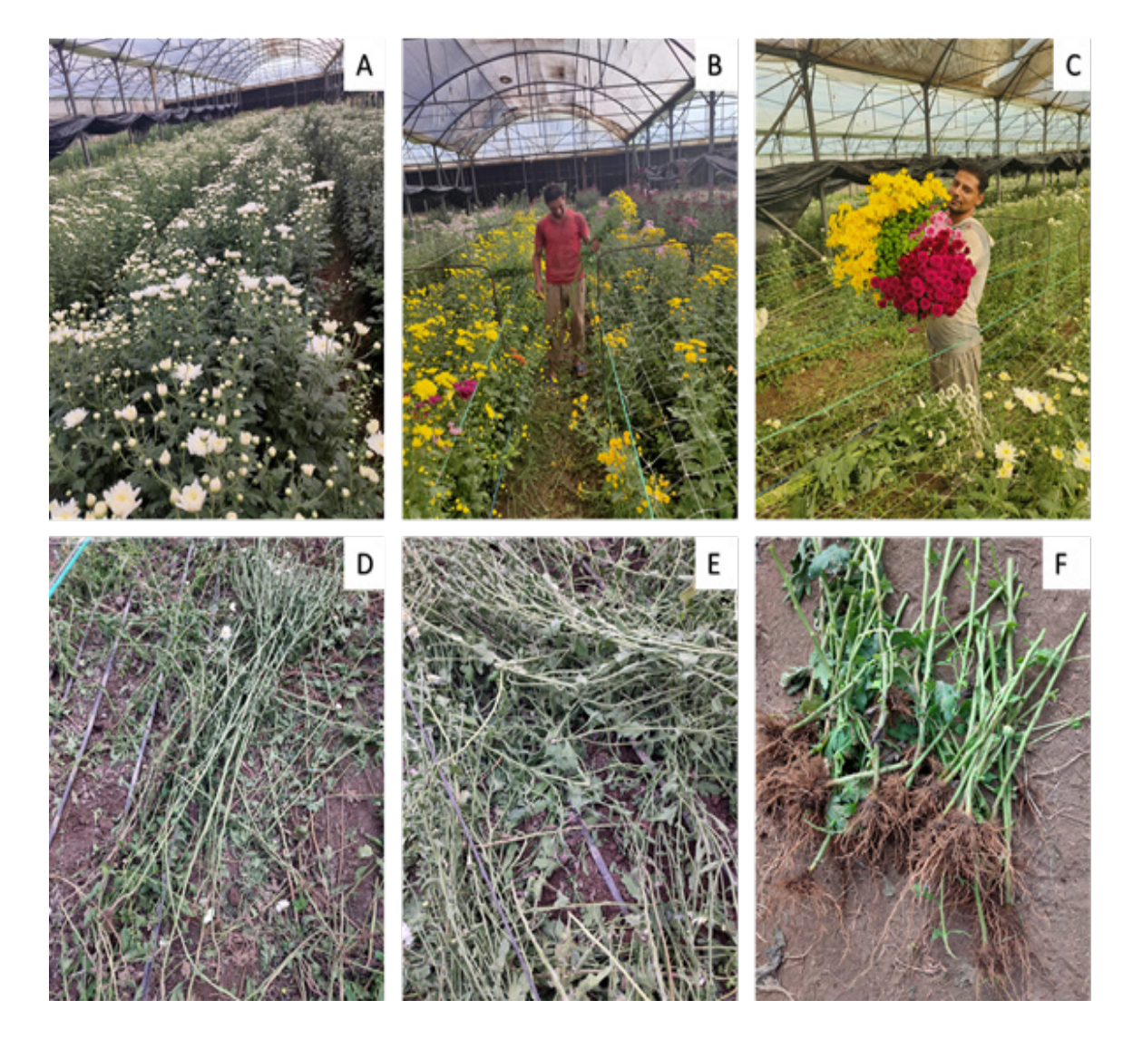
Fig. 1. Source of chrysanthemum wastes:(A) chrysanthemum plants in a greenhouse,(B) labor harvests chrysanthemum flowers and removes leaves and roots,(C) final product of chrysanthemum plant,(D) weak plants with small flowers,(E) non-flowering plants and(F) root wastes after harvesting

(leaves, peels and stems), jute and cotton (stalk), groundnut (shell) and coconut (husk) (Prasad et al. 2020). It is reported that, approximately 20% of agro-products could be damaged due to the poor post-harvest facility and 10% may be eaten by rodents (Prasad et al. 2020). The question that needs to be answered is the agri-wastes a problem or a treasure? To answer this question, it depends on the nature and composition of these agriwastes? The wastes that rich in toxic pollutants or radio-actives represent a real problem and needs a removal of these deleterious materials from the environment. Concerning the useful agri-wastes as almost wastes, they are a real wealth and need turning or transforming into economic products (Kauldhar and Yadav, 2018).