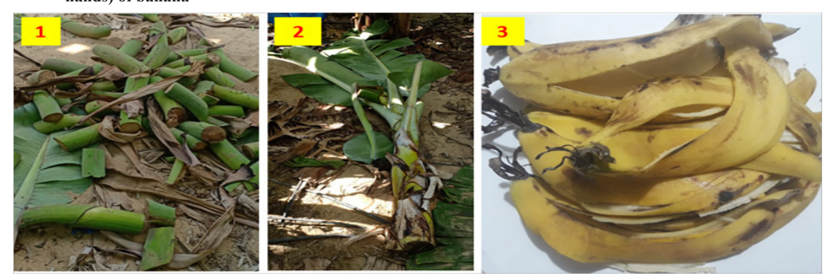
Fig. 4. The most common banana wastes:peduncle base that cut at harvest (photo 1),the mother plants that cut after harvest (photo 2) and banana peels after removing (photo 3)